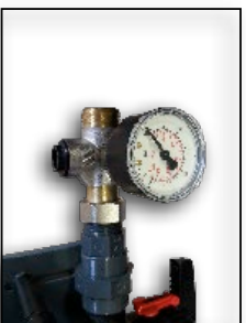
With optional pressure gauge